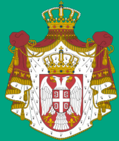
Coat of arms of Serbia

National currency in Serbia is dinar (RSD).