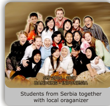
Students from Serbia together with local organizer

I would like to thank everyone involved in this project for all the efforts they made in order to organize it. It was a great experience! I saw and learnt many things. The Student Exchange Programme is a once-in-a-lifetime opportunity, so don't miss it!