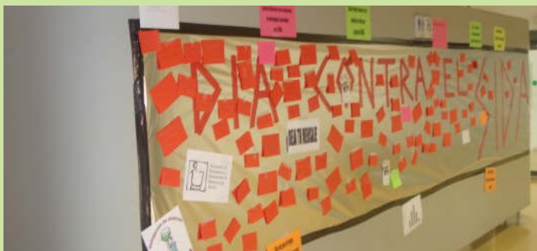
Messages Hall made by students