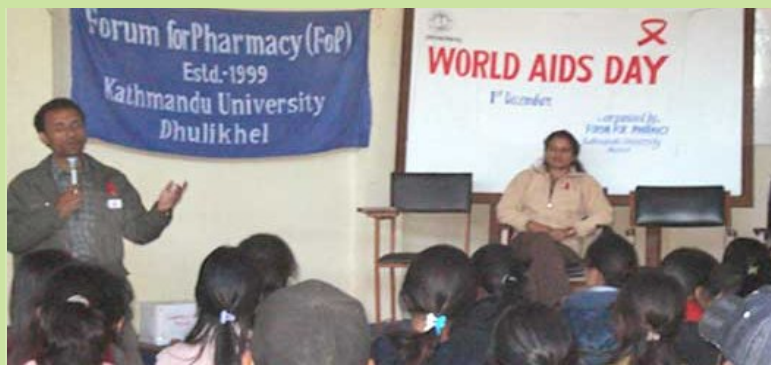
A speaker from NAPN (National Association of PLHA in Nepal) interacting with the audience