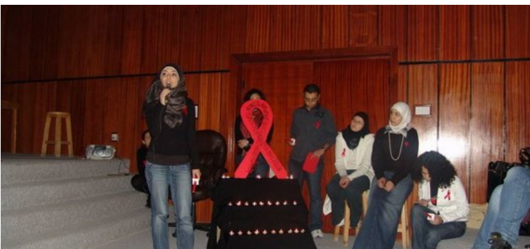
JPSA representative during presentation on AIDS Day in Jordan