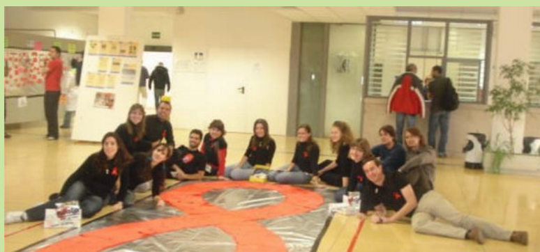
Members of AELFA with a large red ribbon on AIDS Day