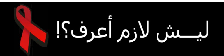
Bookmark translation: "Why do I have to know?" [ie. Why do I have to know about HIV]